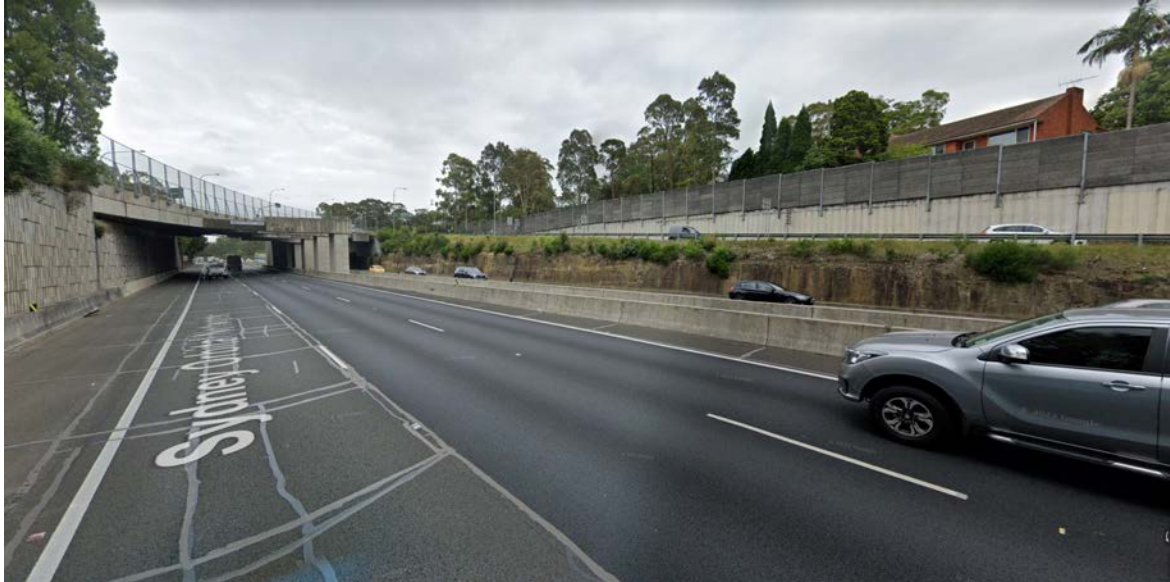
Figure 5: Looking north-west on M2 to the Beecroft Road overbridge. Contemporary house in the Gullies Precinct of the Beecroft-Cheltenham Heritage Conservation Area. The concrete pillars on which the signage is proposed to be sited are in the mid distance and below the level of the screening.