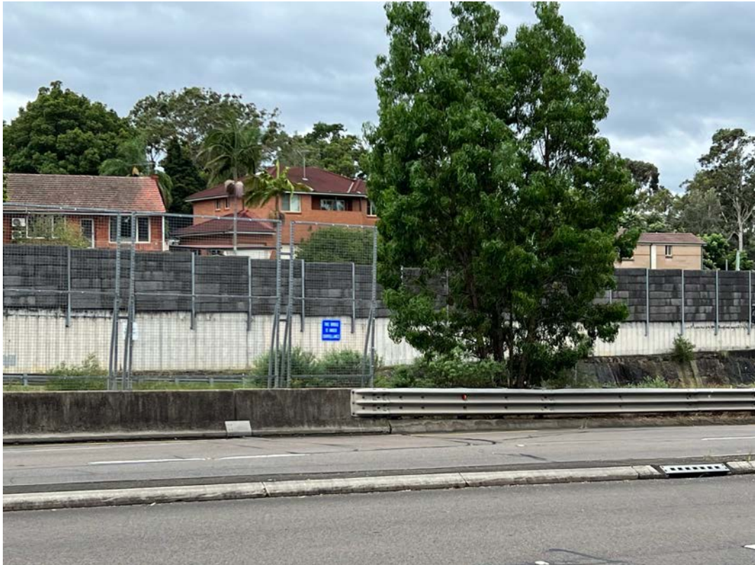
Figure 7: View from Beecroft Road overbridge across to the HCA and contemporary houses. Motorway below.