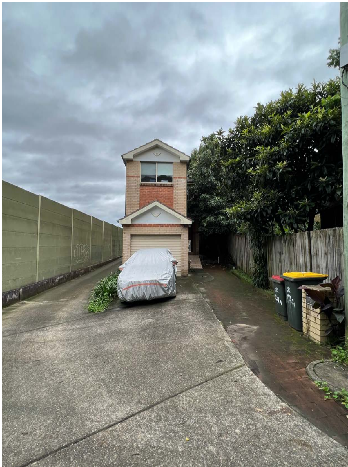
Figure 12: View toward Stewart Close from termination of Old Beecroft Road.