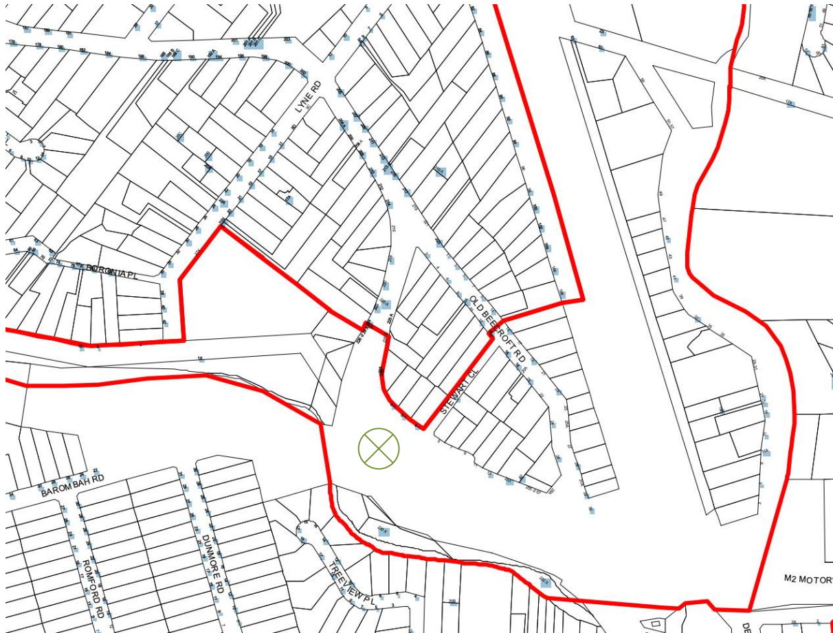
Figure 3: Extract from map of the Beecroft-Cheltenham Conservation Area. Proposed location of signage indicated by green encircled cross. The proposed site (marked by green crossed circle) is within The Gullies Precinct – the southern and eastern most portion of the map HCA and adjacent to the Beecroft-Cheltenham Plateau Precinct to the north of the site. [Hornsby DCP 2013]