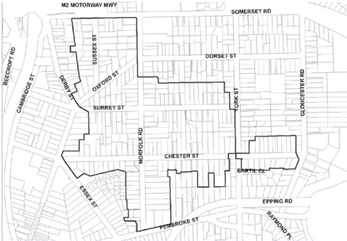
Figure 9.3(k): East Epping Heritage Conservation Area. (C)

Figure 4: The East Epping Conservation Area is to the east and south of the proposed signage site with a railway bridge in-between and will not be impacted by the proposed signage. [Hornsby DCP, 2013]