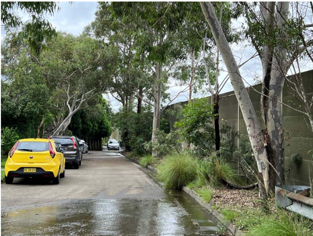
Figure 10: View east along Stewart Close.