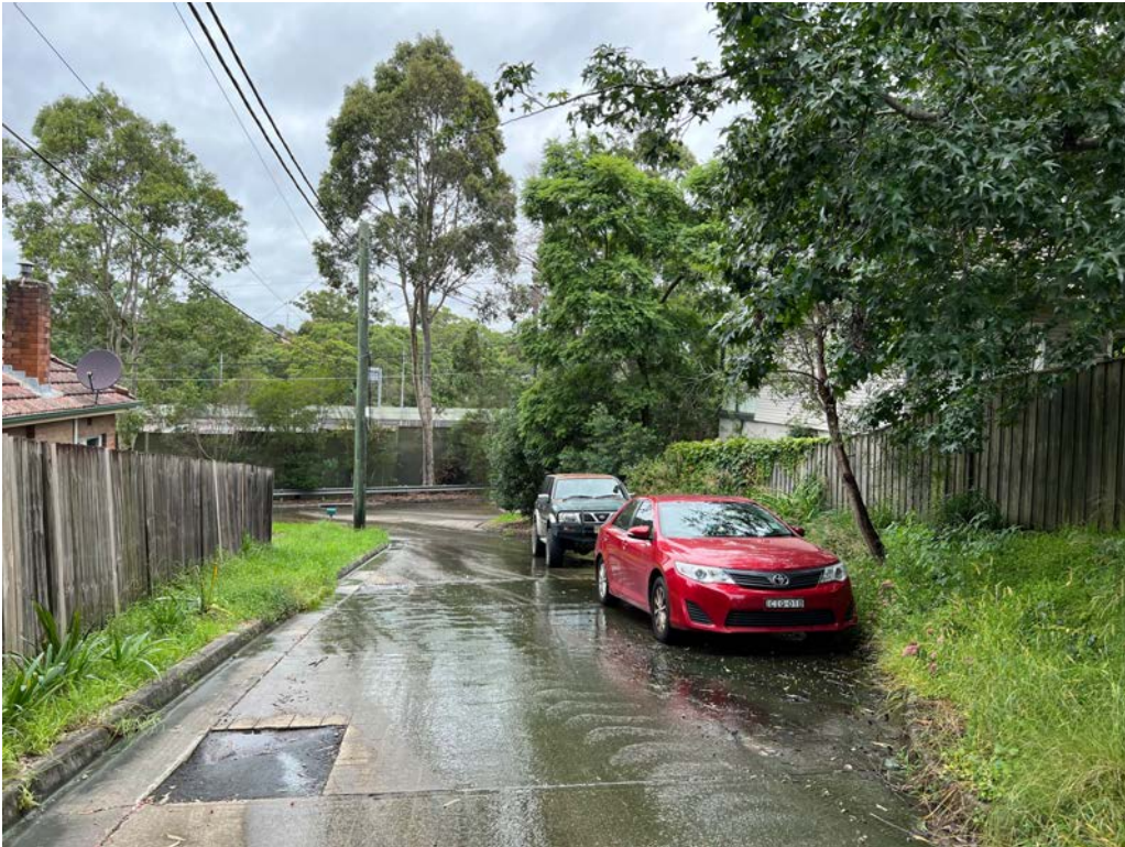
Figure 9: View south down Stewart Close to the motorway