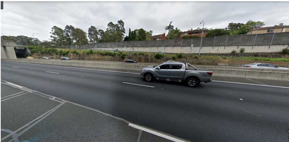
Figure 6: In this view, the location of the proposed signage are the concrete pillars on the extreme left. In the background above and behind the cutting are contemporary houses of Stewart Close adjoining the motorway reserve.