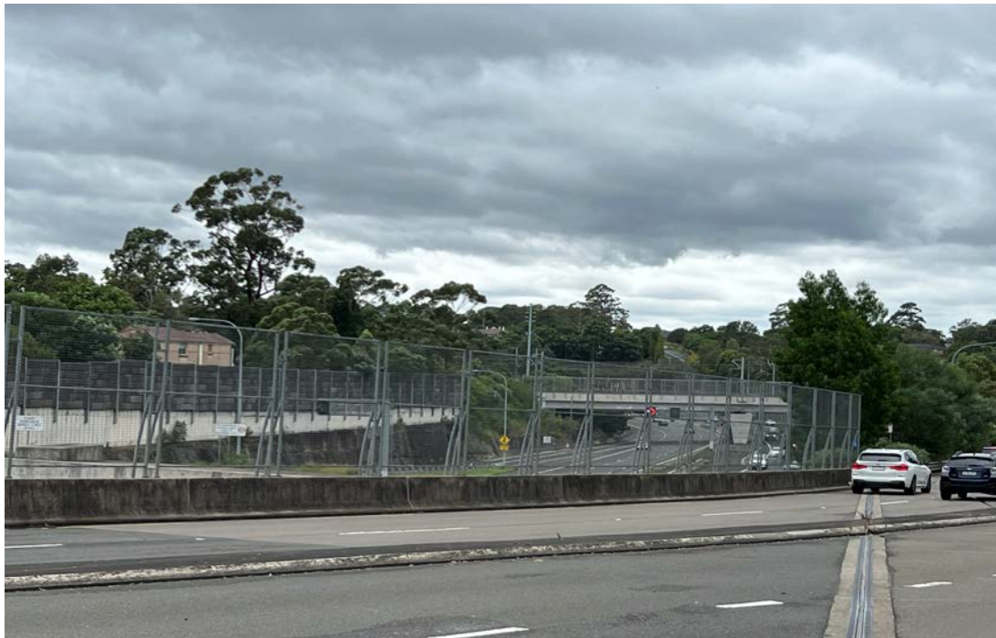
Figure 8: View east along motorway cutting from Beecroft Road overbridge, showing depth of cutting. In left foreground are the tops of the concrete pillars on which it is proposed to erect the signage.