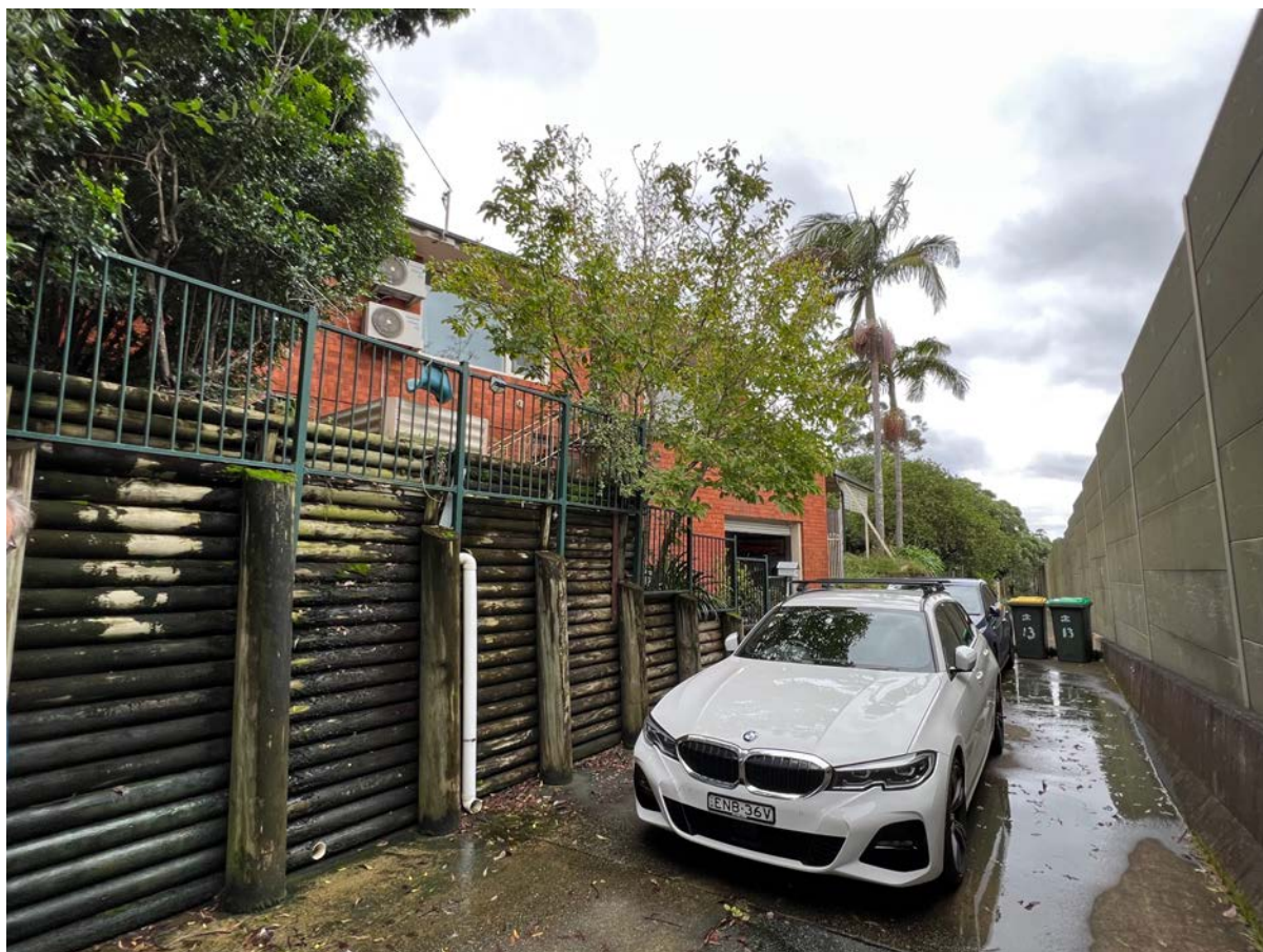
Figure 11: Another view to south along Stewart Close.